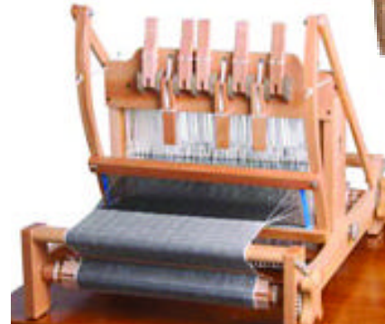
below: Ashford 8 shaft table loom right: Ashford 16 shaft table loom