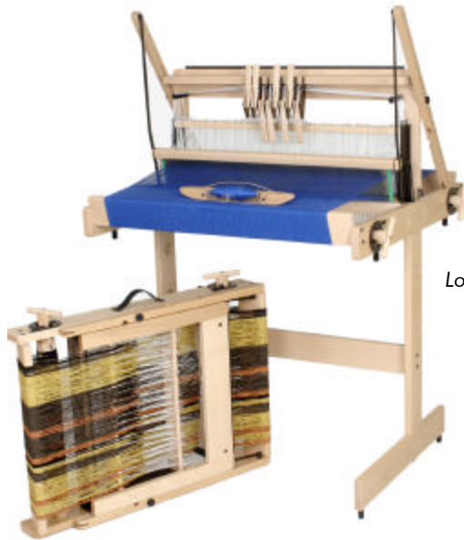
Louët Jane looms right, on stand: 70 cm left, folded: 40 cm

Louët's table looms have for years been among the most popular on the market for their smooth action, excellent finish, and relative portability. They have recently been redesigned to increase even further their portability - the smaller one (40 cm) even has a carrying handle attached to one side bar. The distinctive overslung beater, easy-to-use front-mounted levers and general weaving enjoyment are much liked. These are excellent looms for all-purpose weaving, with the benefit that you can take them to workshops or hide them away when you're not using them.